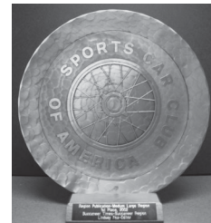
2003 Third Place Medium/Large Publication

Over the weekend drivers got to practice one race in the wet and one in the dry. They learned all about red flags, black flags and even the checkered flag. Once again, the All-In-One Drivers School was a success.